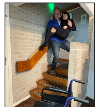
Not the most dignified way up!

Sadly, we have had to turn away community groups who have disabled members, and we have genuine anecdotal stories of some people resorting to an undignified crawling up the stairs on hands and knees or being carried.