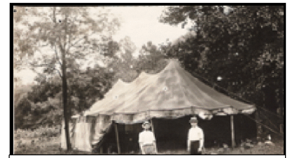
We have come a long way...

The pioneering spirit that encouraged a handful of adults to lay the first foundations for a permanent building has continued down the years as people have given sacrificially in time, talents and money.